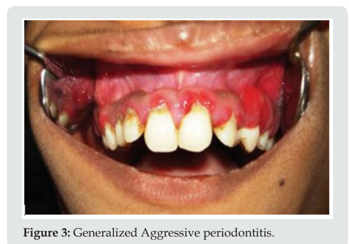
Figure 3: Generalized Aggressive periodontitis.