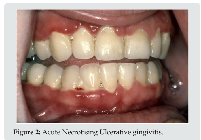
Figure 2: Acute Necrotising Ulcerative gingivitis.